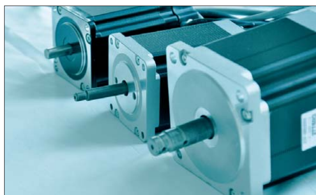
进口马达 / Imported motor