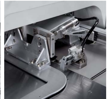
HM 快速换模装置 Template fast changing device