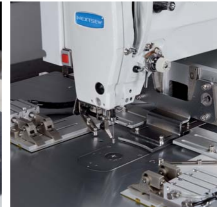
MY 帽檐压脚装置 Helmets device