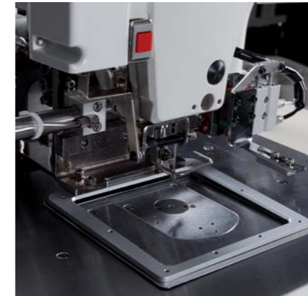
CH 侧滑压脚装置 Side sliding device